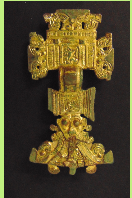
Above: the Cruciform Brooch Below: Amber beads found in the female grave

The burials and these objects were excavated following a metal detectorist find back in 1996. The burials were dated to the late C5th to the early C7th based on the range of finds.