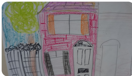
Two of the brilliant houses on the Our Town Map