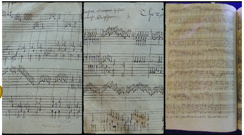
Examples of some of the handwritten music hidden in the pages of the Evesham Bible.