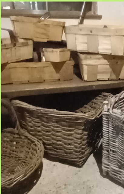
Above: Chip baskets and Pot hampers in the Undercroft

The larger baskets are Pot Hampers. The 'Evesham Pot' was a measure varied with each kind of produce and from district to district. In 1891 Harvey Hunt published the weights of particular fruits and vegetables suitable for these containers for his market in Evesham.