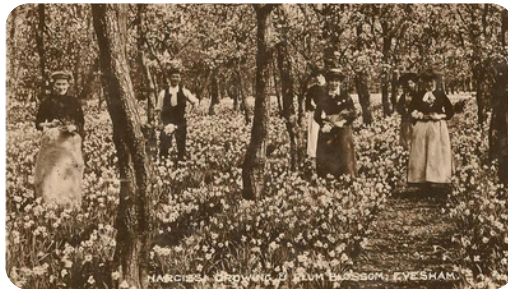
Above, left-right: Evesham Orchards in bloom; the Plum Market in Evesham; Narcissi and Plum Blossom