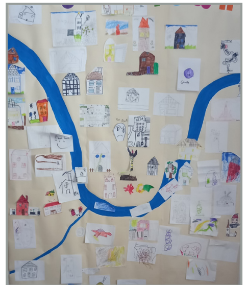
The Our Town Map